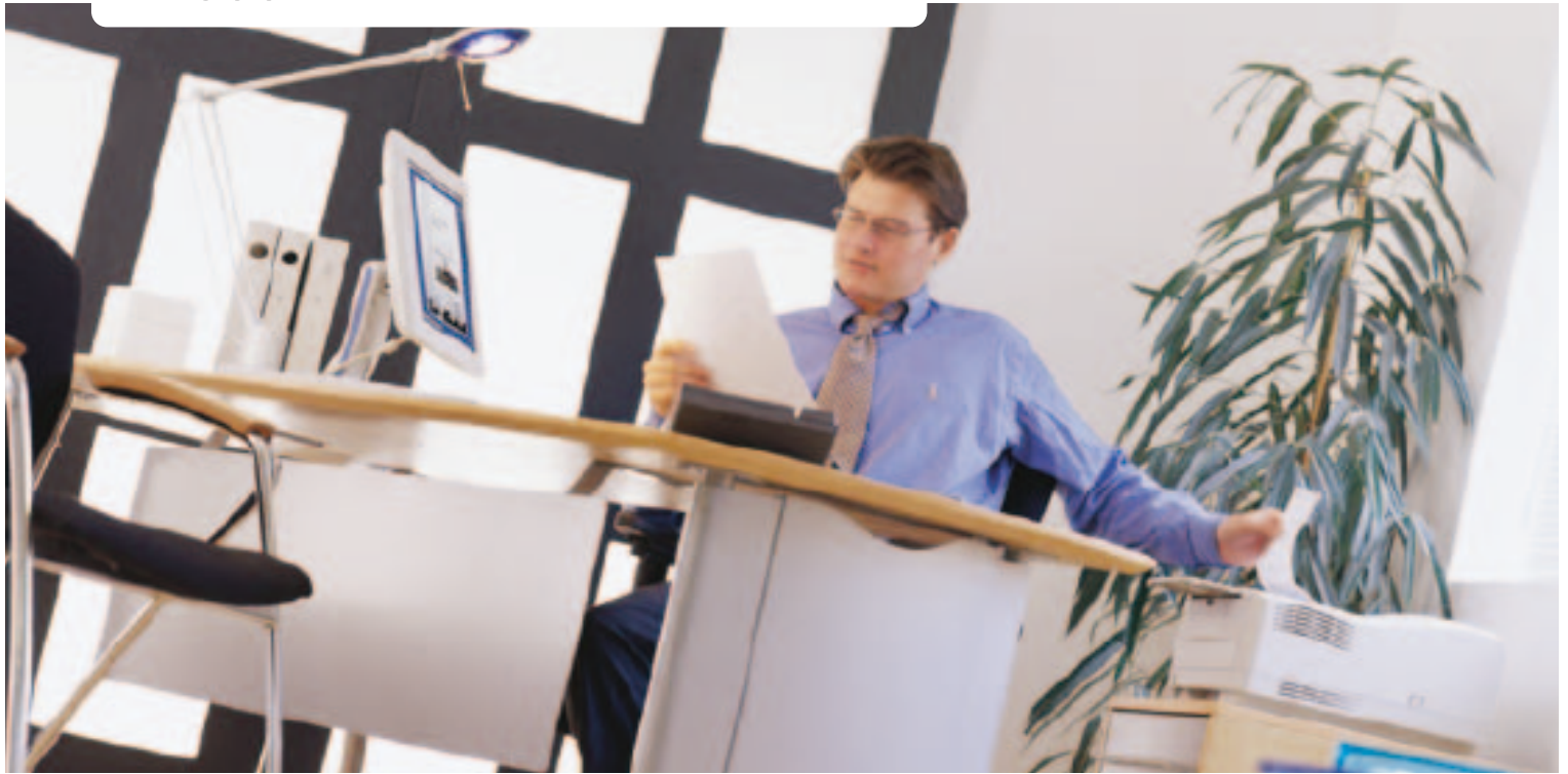
B4100: Personal printing for professionals

Mono printing is the engine room of a smooth running business, the unsung hero powering through the workload.